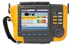
Fluke 810 Vibration Tester