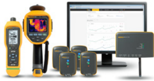
Fluke Ti450 Infrared Camera, Fluke 805 FC Vibration Meter, Fluke Condition Monitoring