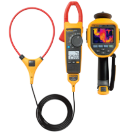
Fluke Professional Series Infrared Cameras, Fluke 376 FC True-rms AC/DC Clamp Meter with iFlex®