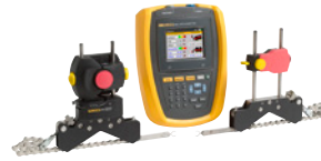
830 Laser Shaft Alignment Tool